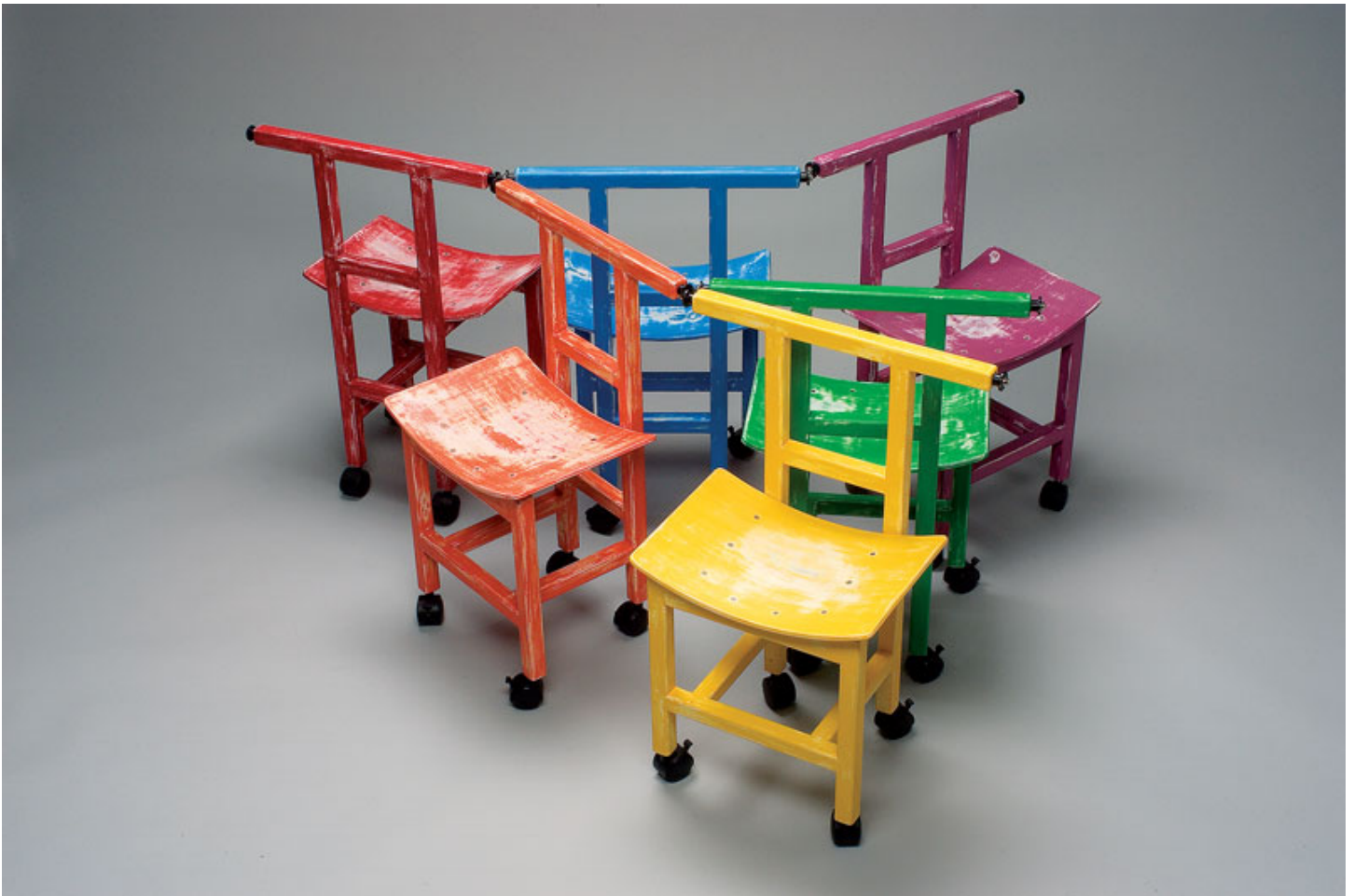
A Spectrum of Chairs

Katonah Museum of Art's colorful new show, Sparkling Amazons . The exhibition focuses on women whose work was featured in a groundbreaking 1951 show of avant-garde artists curated by monumental dealer Leo Castelli, with impressive paintings by Lee Krasner, Joan Mitchell, Elaine de Kooning, and several others.