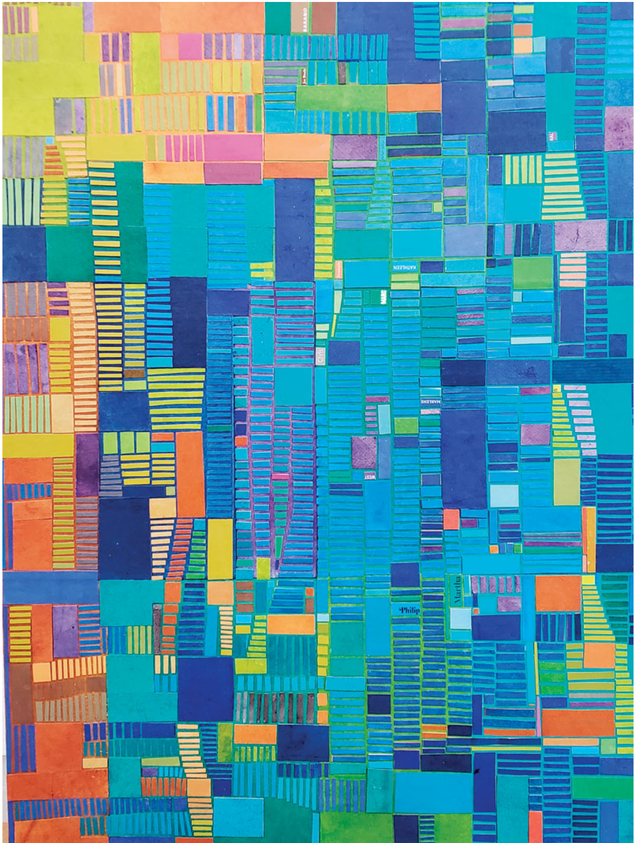
People Connections by Laurie Frick