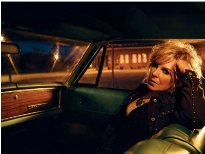
Country Legend Lucinda Williams Is 100% American Made