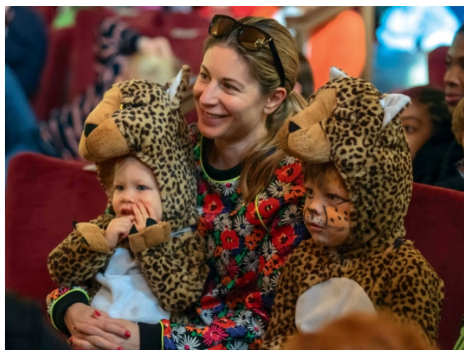
3 Fun Fall Events for Kids