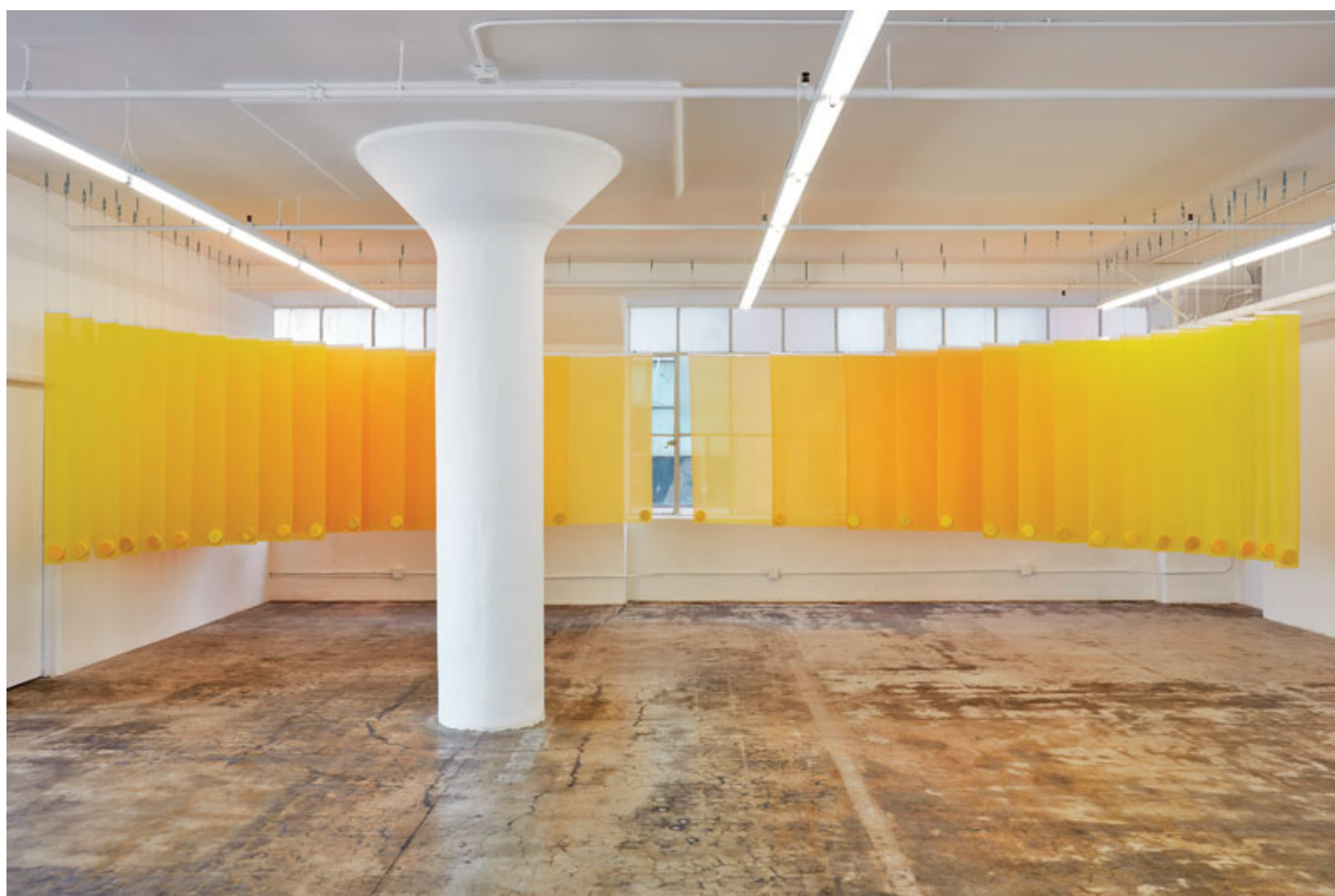
Eva LeWitt, Untitled (Los Angeles) (detail), 2018, silkscreen mesh, organza, silk voile, polyurethane foam, plexi, and wire, dimensions variable