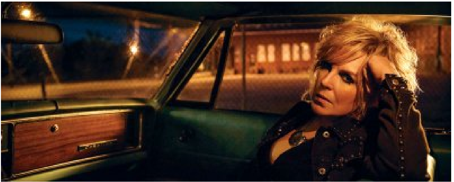
Country Legend Lucinda Williams Is 100% American Made