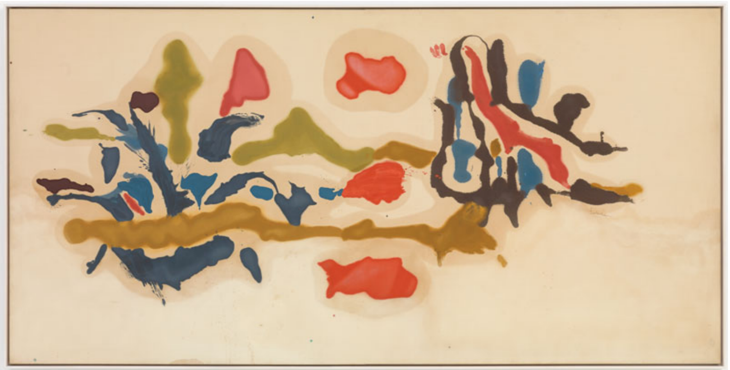
1963.2 Frankenthaler, Helen