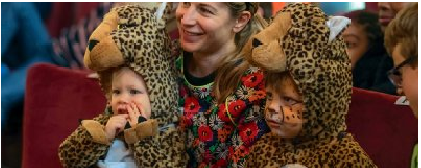
3 Fun Fall Events for Kids